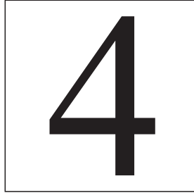
Fig. 1. Example of a small image where the caption is placed next to the image.

appearance for the proceedings, which also increases the readability of the individual papers. Please note that if images and tables are placed at the top of the page, the label will be placed above the object. If, on the other hand, the objects are placed at the bottom of the page, the caption is placed below them. In your \text{\LaTeX} source code, the \caption command must be in the right place. Captions should be written in \text{\LaTeX} source code if possible and should not be included into the image. They should consist of at least one complete sentence and end with a period/fullstop. Subheadings (e.g. Fig. 2a), should also end on a period/fullstop.